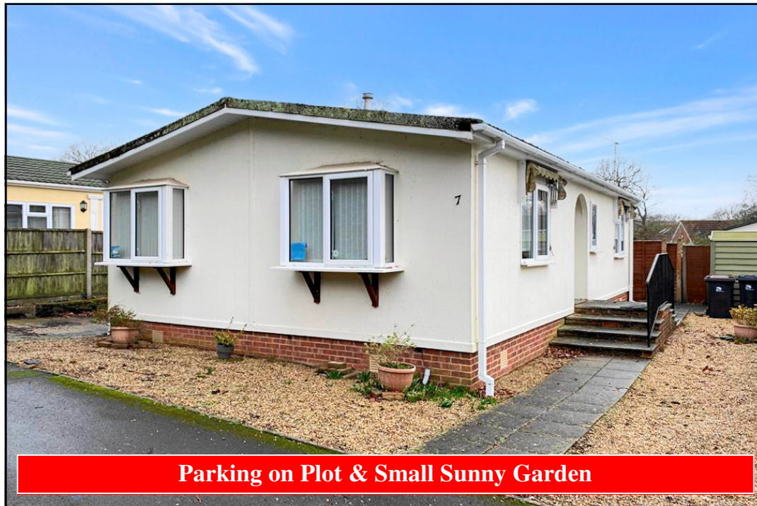
Parking on Plot & Small Sunny Garden

7 Dewlands Park, West Close, Verwood, Dorset. BH31 6PR